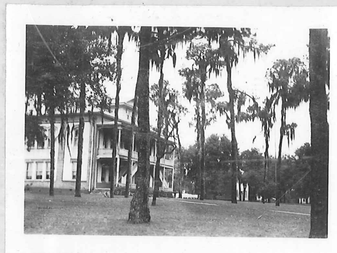
PASCO COUNTY HIGH SCHOOL CAMPUS