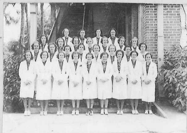
GIRLS' GLEE CLUB