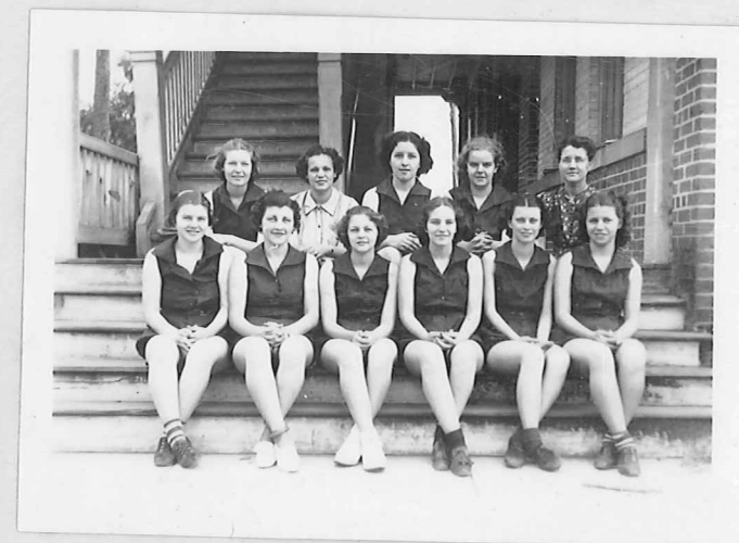
Girl's basketball team